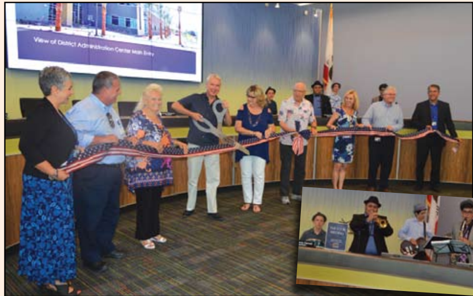
Dedication of New District Administration Center: The Palm Springs High Spirit of the Sands "Four Fedoras" quartet, at right, entertained at the recent dedication of PSUSD's new District Administration Center located at 150 District Center Drive adjacent to the Service Center, which has been at that location for about eight years. Above, members of the Board of Education and administration cut the ribbon at the dedication ceremony. The new building houses all District department offices except for Mental Health and the Foundation for PSUSD, both of which are located on the corner of Farrell and Baristo along with the Family Engagement Center's Palm Springs location.