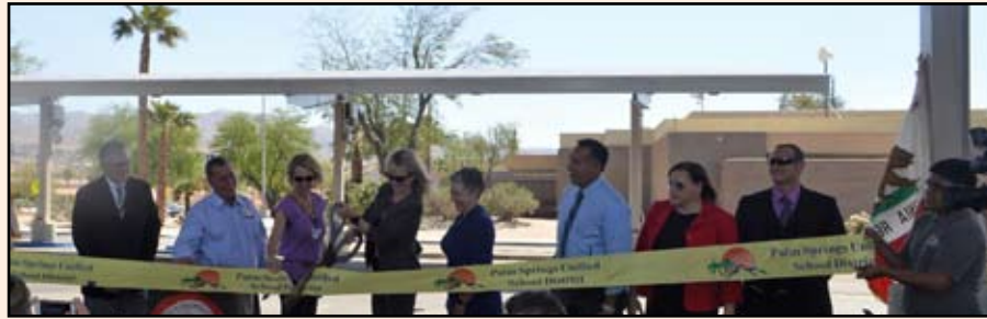
New Solar Project at Desert Springs: The District recently celebrated the commemoration of the completed covered parking lot and ball field solar structures at Desert Springs Middle School, with a ribbon cutting and dedication ceremony. The project was funded by a $1.6 million grant from South Coast Air Quality Management District AB 1318 Mitigation Fees Fund, aimed at reducing or mitigating emissions in Valley produced by PVC Sentinel Peaker Plant. The project will save District about $1.8 million energy costs over the next 20 years. The District owns solar arrays at three other schools and has 11 solar parking canopies at various sites acquired through a power purchase agreement projected to save $10 to $12 million in energy costs over next 20 years.