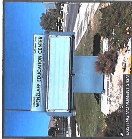
EXISTING MONUMENT SIGN

REMOVE AND DISPOSE OF EXISTING MONUMENT SIGN.